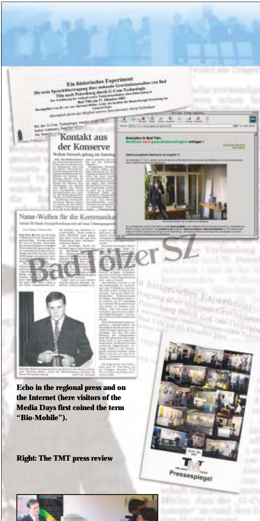
Echo in the regional press and on the Internet (here visitors of the Media Days first coined the term “Bio-Mobile”).