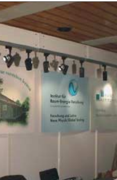
View of the exhibition stand at the Tölzian IT- and Media Days.

are also artificial electromagnetic fields created by man for purposes of communication and energy transfer. These may be electromagnetic carrier waves of various frequencies and wavelengths that are modulated in different ways. Artificial electromagnetic waves have only come into existence fairly recently. This means that neither human organisms nor the organisms of animals and plants have had a chance to get used to their presence. Nor must it be expected that adjustment of organisms to these fields will take place in the future since the artificial electromagnetic fields do not harmonise with the natural electromagnetic background field. Such disharmony between artificially generated and naturally occurring electromagnetic fields is only due to the fact that those